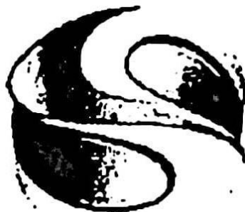
(“Defendants’ ‘S’ Trade Mark”)

[8] That notwithstanding, the fifth defendant had on 23 April 2018 also applied to MyIPO to register the following mark in class 9, 16, 28, 35, 36, 38, 41, 42, 43 and 44: